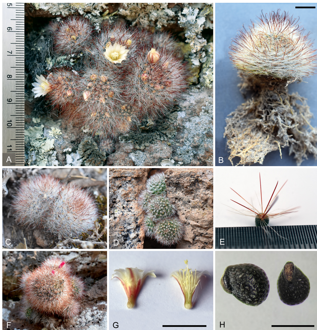
Fig. 3. Morphology of Mammillaria morentiniana during dry and rainy seasons. – A: plant flowering in habitat; B: stem and roots; C: stems during dry season covered by radial spines resembling white needle-bristles; D: stems during rainy season showing hydrated and expanded tubercles; E: close-up of tubercle and areole bearing six central spines; F: plant bearing red and claviform fruits; G: flower in longitudinal section, outside and inside views; H: seeds. – Scale bars: A = primary graduations of 1 cm, secondary graduations of 1 mm; B = 10 mm; E = graduations of 0.5 mm; G = 10 mm; H = 1 mm.

0.7(–9.2) mm long, glabrous. Flowers infundibuliform, 7–9 mm long; outer tepals pale yellow with reddish middle stripe, lanceolate, margin entire; inner tepals pale yellow, lanceolate, margin entire; filaments pale yellow; anthers yellow; style pale yellow; stigma pale yellow, 4-lobed. Fruit pink, claviform, 10–20 mm long; seeds black, c. 1.1 mm in diam.; aril absent; testa pitted.