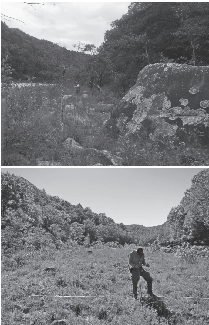
Figure 2. —Riverscours monitoring in an Appalachian Acidic Sandstone Rivershore Prairie at Gauley River National Recreation Area (top) and in a Cumberland Riverside Scour Prairie at Big South Fork National River & Recreation Area (bottom).

not only the timing and volume of water, but also the water temperature and the transport of sediment (Parasiewicz 2001; Bennett and McDonald 2006). Climate change can also alter river flow regimes, changing the frequency or intensity of scour events, especially in times of unprecedented storms and droughts. Warmer winter temperatures will reduce winter ice accumulation and spring ice scour that are critical to maintaining riverscours communities in the northeastern United States (Rustad et al. 2012). In addition, multiple anthropogenic stressors impact rivers in the eastern United States such as point and non-point source pollution; acid rain; floodplain and channel alterations from roads, railroads, and bridges; heavily concentrated recreation; municipal water withdrawal and wastewater discharge; and nonnative invasive plants (Podniewski et al. 2010).