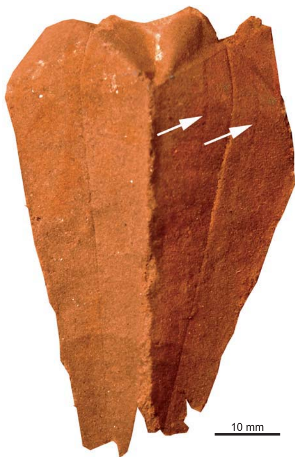
Fig. 1. Topotype of the conulariid scyphozoan Metaconularia? anomala (Barrande, 1867) from the Drabov quartzites of Bohemia, NM-PM2-L25097. The specimen is a steinkern with a plicated apertural closure. Arrows point to accessory lines which may be muscle tracks.

The preserved length of this incomplete specimen is about 58.3 mm, but its estimated full length would have been at least 90 mm. The apex is missing. Width at the aperture is approximately 22.5 mm. Therefore, the length/width ratio is about 3. The cross section is quadrangular (i.e., not 3-sided), and the apical angle about 15°, although this is difficult to determine accurately due to preservation. The corners are not as sharp as they are in some other specimens of M.? anomala , and the faces are slightly concave. It is possible to observe the midline marked by a groove with accessory lines forming very faint grooves about 4 mm on either side of the midline. No ornament (e.g., transverse ribs or tubercles) is visible but very gentle transverse corrugations can be perceived. The triangular apertural ends have a length of 11.3 mm, about 12% of total exoskeletal length.