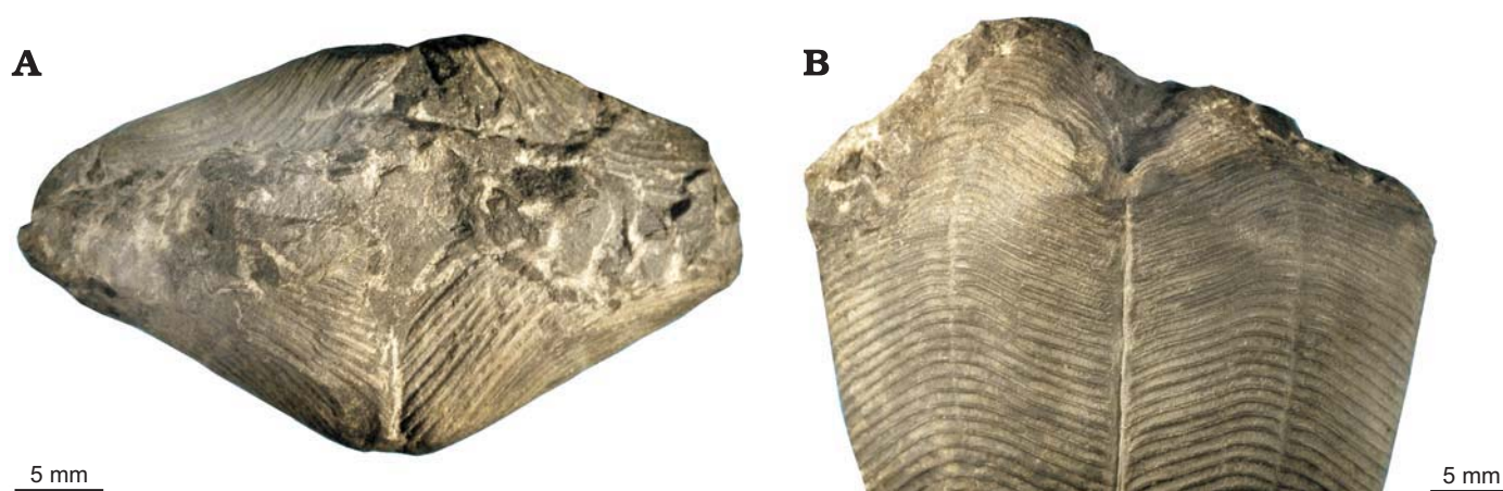
Fig. 4. Closure with triangular terminal ends in a toptype of Conularia brongniarti Archiac and Verneuil, 1842 from the Devonian of Néhou (Manche, France), FSL 15605, in apertural ( A ) and lateral ( B ) views.

sides of the reinforced corners, that pulled the exoskeleton towards the interior. Bischoff (1978), however, supposed that taxa without any reinforcement of the corners could not have pos-