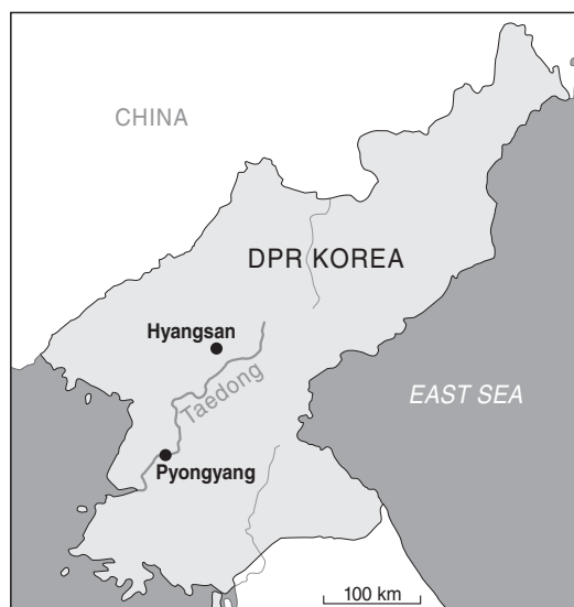
Figure 1. Survey sites during 1999–2004 were located in Pyongyang (Diplomatic Compound, Moran-bong Park, Munsu-bong Park, Taedong-gang) and Hyangsan (including the Myohyang mountains).

Birds were surveyed through direct field observation at several sites (Fig. 1) between April 1999 and November 2004, the intensity increasing until 2003 (number of days with at least several hours of observation: 14 in 1999; 60 in 2000; 137 plus two from R.J. Tizard in 2001; 219 plus 13 in 2002; 247 in 2003; and 52 in 2004). In Pyongyang, observations were spread in all weeks of the year, and in Hyangsan in most weeks, excepting some of January and August and most of February. Standardised routes were followed each day at Moran, Munsu and Hyangsan, allowing comparison of counts between days within each site; but routes varied along the Taedong. Myohyang was visited less regularly, but multi-day forays deep into the protected area, across its entire altitudinal range (100–1909 m), were spread across the breeding season. Chief characteristics of each site are given in Duckworth (2006: Table 1). Arctic Warbler is very similar in plumage to Greenish Warbler P. trochiloides plumbeitarsus (Beaman & Madge 1998), a locally common breeder in Myohyang's higher altitudes, and rare passage migrant through Pyongyang (own data). Silent birds may elude certain identification, but song and calls allow easy identification (e.g. Lekagul &