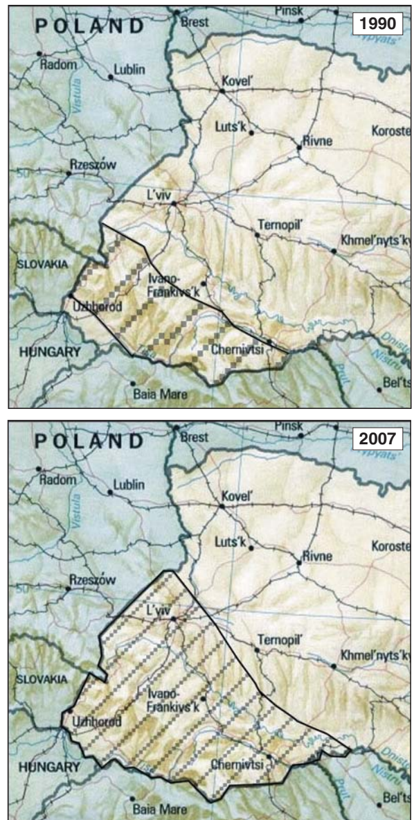
Figure 2. Distribution of the Ural Owl in western Ukraine, as of 1990 and 2007.

In Ukraine, Ural Owls occurred only in the Carpathians area until the last decade. The subspecies S. u. macroura has increased its range southwards and westwards in Slovakia and Hungary (Mebs & Scherzinger 2000, Danko et al. 2002, Adamec et al. 2003, Kristin et al. 2007). The placement of nest boxes has influenced the process of range expansion in eastern Slovakia (Danko et al. 2002). Reintroduction programs at German and Czech sites have been able to re-establish apparently stable populations in the Moravian-Silesian Beskids (Schäffer 1993, Scherzinger 1996, Bufka & Kloubec 1999, Vermouzek et al. 2004).