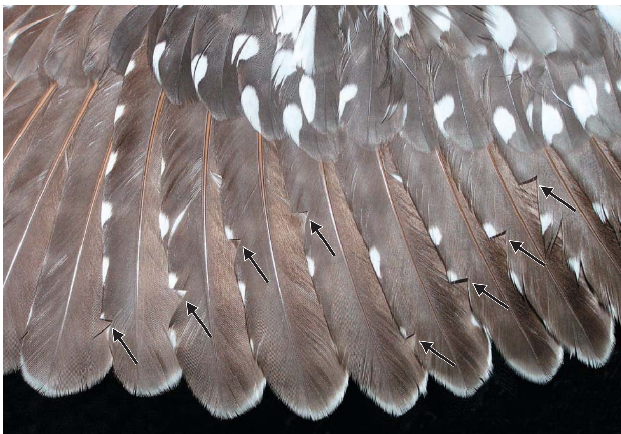
Figure 1. Photograph of open Northern Hawk Owl wing showing method of marking (indicated by the arrows) the position of secondaries in the wing during autumn moult verification.

Intensity of shedding index (ISI) describes how often and how long feathers are shed in a given period or over the whole moulting season. It is the ratio of total length of shed feathers to number of days and is expressed in mm/d. The length of shed feathers were derived from an owl feather database where average length of primaries, secondaries and rectrices was calculated on the basis of 24 feather sets (MC, unpubl. data). This index was used to investigate the effect of ambient temperature on feather shedding patterns.