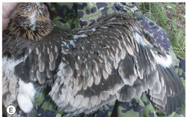
Appendix 1. Offspring of R7400 (backcrosses between F1 hybrid male and A. pomarina female) on 25 July 2006 (A–C) and on 15 July 2009 (D–E).