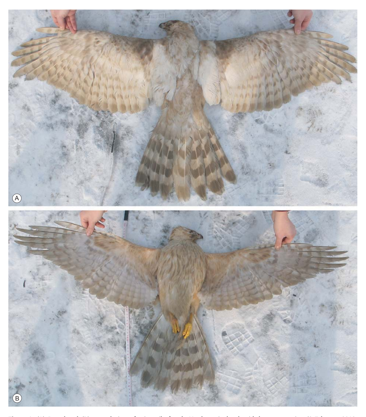
Figure 1. (A) Dorsal and (B) ventral view of a juvenile female Northern Goshawk with brown mutation (2 February 2012, Sędziszów, southern Poland).