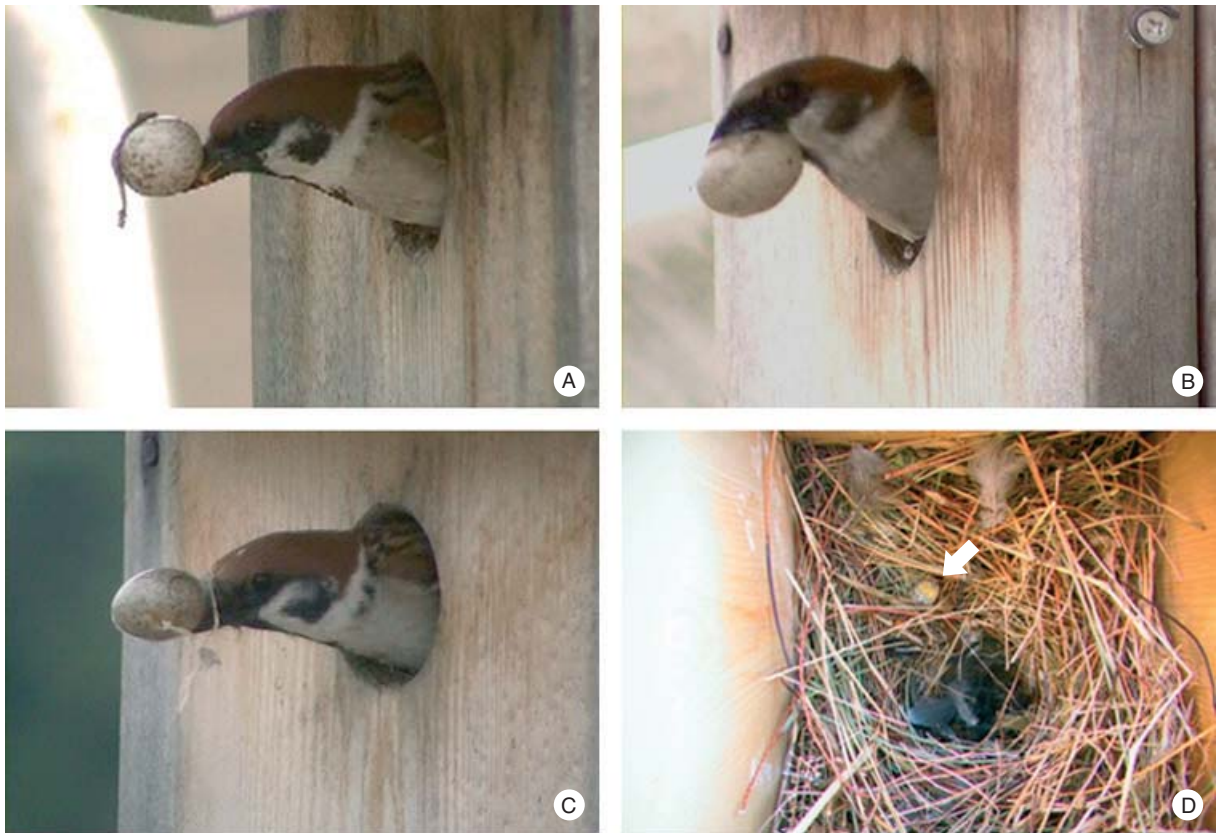
Figure 1. Egg removal behaviour by Eurasian Tree Sparrows at nest boxes A, B, C, and the destroyed egg (arrow) in nest D.

was laid in nest box A. One of the new breeders was A2; the other was a ringed female, identified by DNA-analysis. Hence, A2 is presumed to have been a male. The pair produced five eggs and raised one chick in the new breeding attempt.