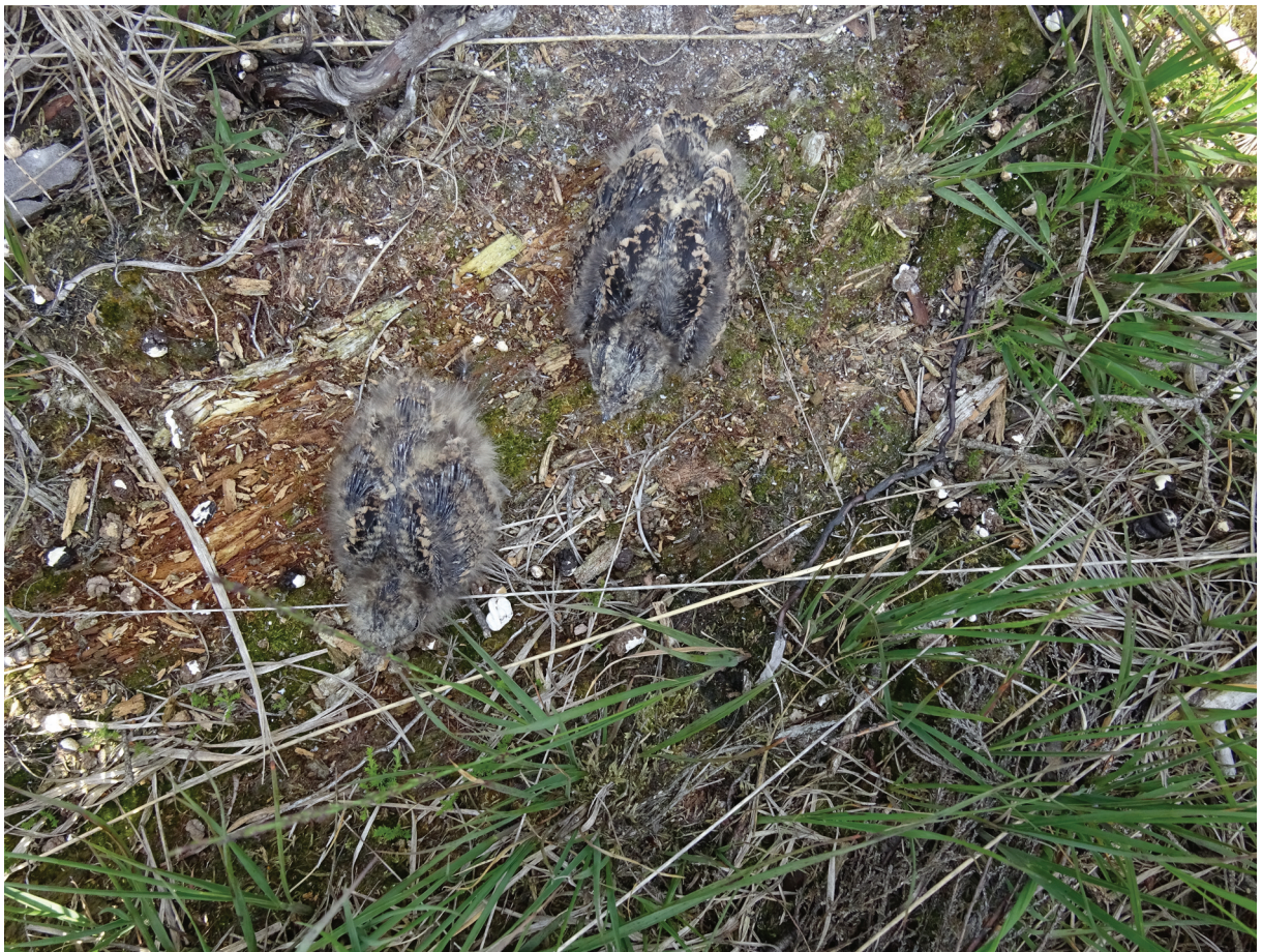
Typical nest of European Nightjar, the 11–12-day old chicks are surrounded by faecal sacs (white blobs) which can be used to investigate diet (photo Rob G. Bijlsma, Forestry of Smilde, Drenthe, 2 August 2017).

Without basic monitoring of the natural world none of these worrying trends could have been quantified and presented to the public and governmental authorities. Vast insect declines tell us something about the environment that transcends insects: we are poisoning the living world on a massive scale. How exactly insect crashes cascade into higher trophic levels is less easy to elucidate, not least because profound environmental changes across the globe are working in concert. What is particularly worrying is not so much the fact that we