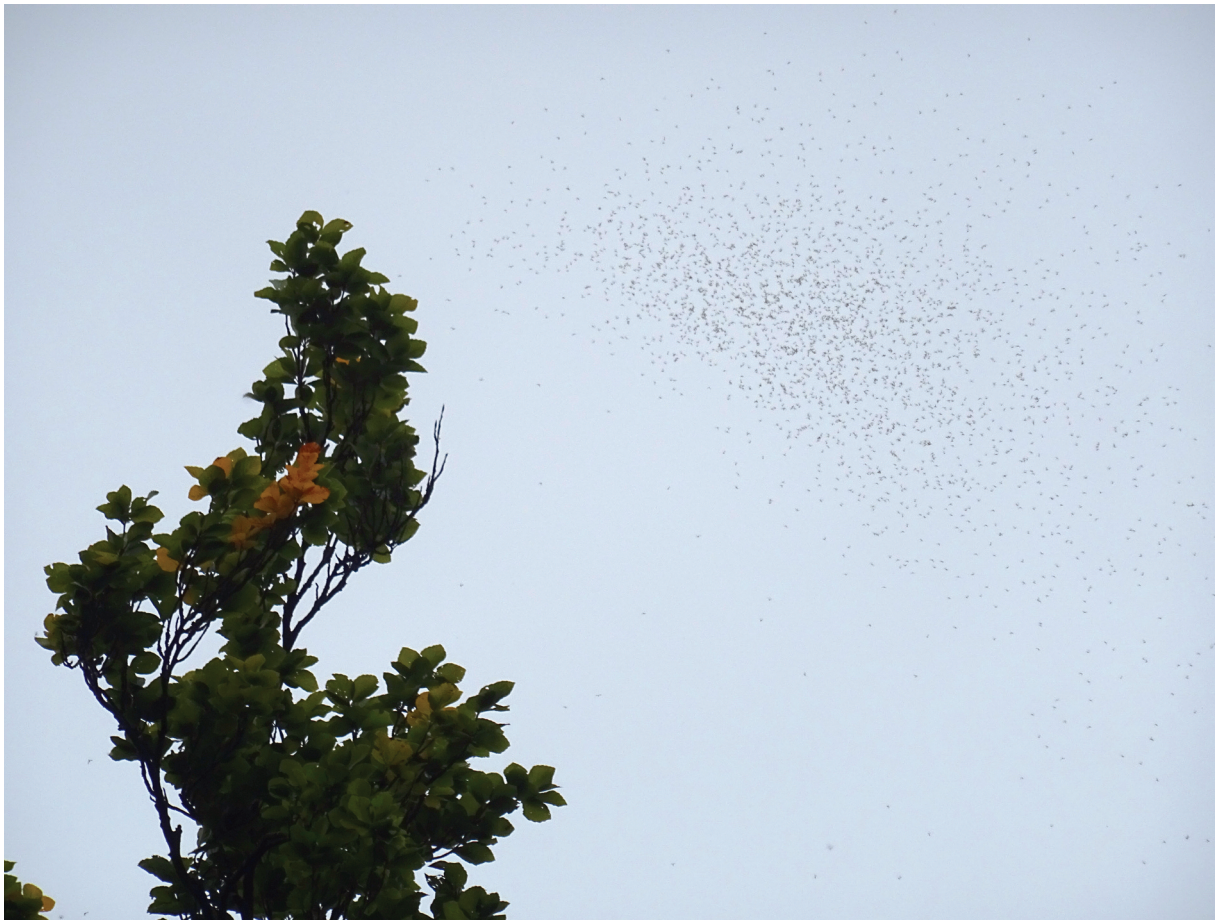
The observer in a tree top used to see dancing mosquito swarms all over the forest, often towering above his own head, but those times are no more. Insects have declined dramatically, including chironimidae (photo Rob G. Bijlsma, Bokkenleegte, Drenthe, 23 September 2019).

impact on populations of insectivorous passerines is surprisingly small and contradictory, with increases and declines within families and within habitats. The Willow Warbler Phylloscopus trochilus , for example, shows a decline, whereas its close relative Chiffchaff P. collybita is increasing. And what about Goldcrest Regulus regulus (decline) compared to Firecrest R. ignicapillus (increase)? Why is European Nightjar Caprimulgus europaeus at the moment commoner than ever before in the past half century, when its steep decline in the 1970s and 1980s was cause for concern? This is especially counter-intuitive because breeding is largely confined to nature reserves, where insect declines in 1989–2016 amounted to 75% in biomass (Hallman et al. 2017). Among the insects adversely affected, moths are high on the list (review in Sánchez-Bayo & Wyckhuys 2019). Moths also figure prominently in diets of Nightjars: >80% of the food studied in the