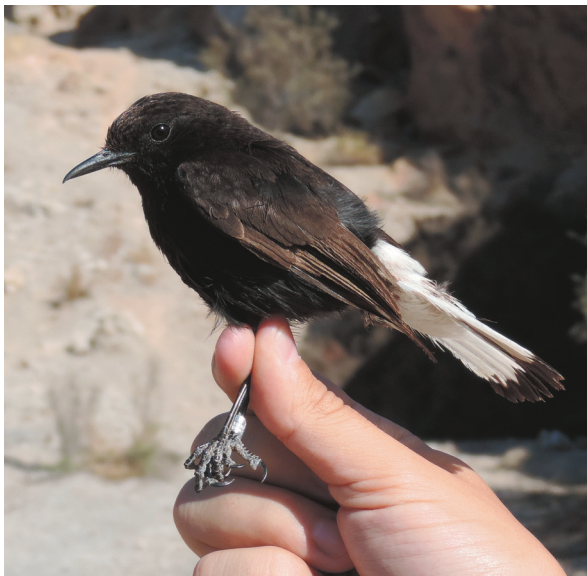
First-year male Black Wheatear in breeding habitat (22 July 2014, Alicante, Spain).

The study was carried out in two arid mountainous areas with eroded slopes around the city of Alicante (38°21'N, 0°27'W) in south-eastern Spain, where the species reaches densities of up to 4 birds/10 ha (Pérez-Granados & Pérez 2018). Sites were separated by 2.5 km, located at 100 m a.s.l. and had a mean annual temperature of 18.3°C and a mean annual precipitation of 311 mm (Spanish State Meteorological Agency 2019). Fieldwork took place during July–October of the years 2014–2016, after the breeding season. Data on post-breeding moult were only collected during the years 2014 and 2015. Mean daily temperature during the study period and years considered was 24.7°C, while mean total precipitation was 95.9 mm (Spanish State Meteorological Agency 2019).