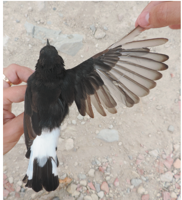
Pattern of the post-breeding moult of a first-year male Black Wheatear. This bird had completed moult of P1–P6 and S1, and P7 and S2 were growing, S3 was starting to grow and P8–10 and S4–S6 were not moulted (11 September 2017, Alicante, Spain).

Black Wheatears were caught using small spring-traps baited with Morio Worms Zophobas morio and with the aid of a playback within their territories during the first two hours after sunrise. Birds were ringed to avoid pseudoreplication, weighed with a precision scale (accuracy 0.1 g) and their tarsus length was measured with digital callipers (accuracy 0.01 mm) in order to estimate body condition index (see below). All individuals were sexed and aged as immatures (birds that had not yet undergone a complete moult) or adults (birds