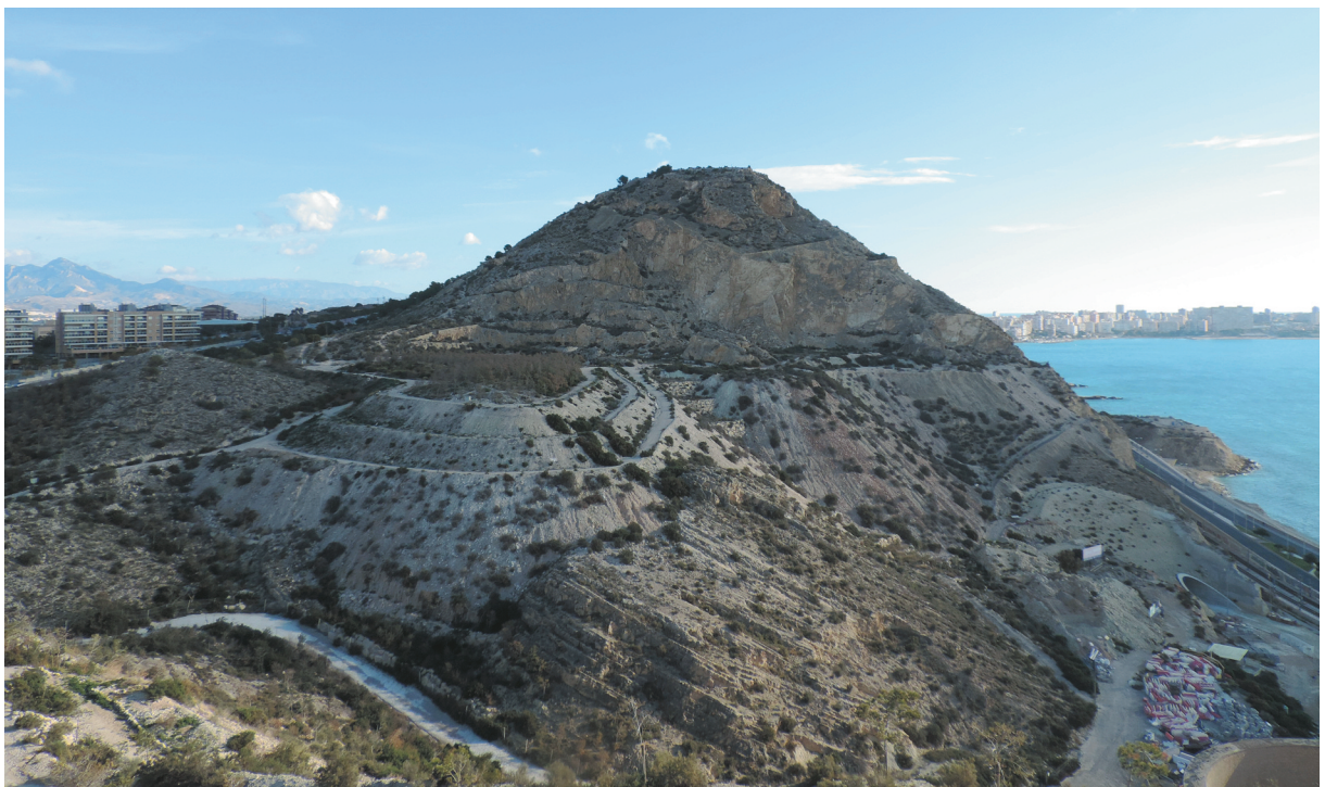
Serra Grossa (Sierra de San Julián) is an arid mountainous area (height 161 m) with eroded slopes and abandoned quarries around Alicante. Here, the Black Wheatear acquires densities of up to 4 breeding birds/10 ha (14 February 2015, Alicante, Spain).

This study has three main goals: (1) to provide the first detailed description of the post-juvenile moult of the Black Wheatear and assess how it is effected by sex and body size, (2) to estimate the post-breeding moult duration and speed of the Black Wheatear, and (3) to evaluate the effect of sex and date on body condition during the post-breeding moult.