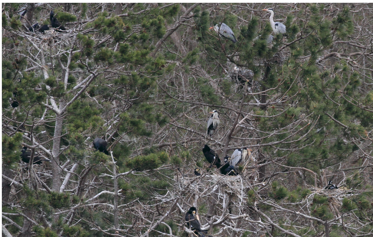
Mixed-species colony of Great Cormorants and Grey Herons at the study site in Aomori, Japan (19 April 2016).

‘staying on nest’ (a bird perched on its own nest or on a branch near the nest) or ‘approaching the predator’ (a bird left its own nest and perched on a branch near the predator). In addition, we considered alarm call and intimidation as aggressive behaviours. For the analysis, we used all birds that were within a 5-m radius of the predator when the predator appeared.