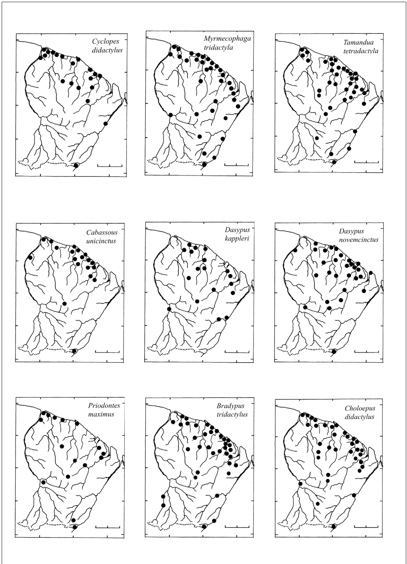
FIGURE 3. Maps of French Guiana with localities of observations for nine species of Xenarthra. The capture data from Petit-Saut have been allocated to a single locality, but they derive from a ca. 125 km 2 area along the Sinnamary catchment (as explained in Vié, 1999: pp. 120–122). The scale bar on the bottom right of each map represents 80 km. See text for further details.