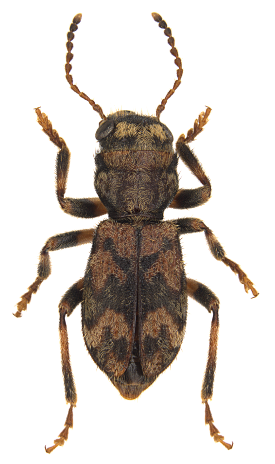
Fig. 1. Nonalatus epigaeus sp. n., habitus.

Head: Red-brown to dark brown, glossy; with dense, fine, regular punctation. Labrum brown, bilobed; anterior part of clypeus yellow, glossy; mouth parts more or less yellow-brown to light yellow, except the black mandibles; terminal labial palpomeres securiform, terminal maxillary palpomeres with sides parallel, constricted apically. Gula long, light red-brown, glossy, gular sutures apically slightly divergent, gular process of medium size. Head including eyes more or less as broad as anterior width of pronotum, vested with black and white setae, behind middle with a broadly Y-shaped pattern of white, depressed setae. Eyes small, coarsely facetted, margined, conspicuously emarginate at antennal insertion, with a brush of yellow setae; interocular space (frons) almost three eye widths. Antennae with 11 antennomeres, long, stout, reaching base of pronotum when laid back, brown, from A8 onwards becoming darker, A11 only basally narrowly dark, remainder light brown; A1 very long, slightly bent; A2 short, cylindrical; A3 twice as long as A2; A4 slightly shorter than A3, slightly dilated distally; from A5 onwards dilated distally, becoming thicker and more compact; A4–A10 progressively becoming slightly