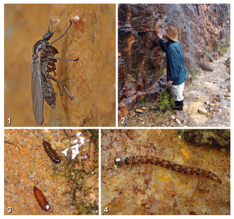
Figs 1–4. Afrothaumalea stuckenbergi sp. n.: (1) female; (2) Steve Marshall collecting immatures on rock face at type locality; (3) pupae; (4) larva.

S-shaped beneath wing, projecting along posterior margin of wing sheath. Respiratory organ short, cylindrical, truncate apically, with spiracular openings encircling apex; abdomen with lateral open spiracles on segments 5–7, spiracles directly dorsally. Caudal segment truncate, lacking hook-like process. Chaetotaxy lost during preservation.