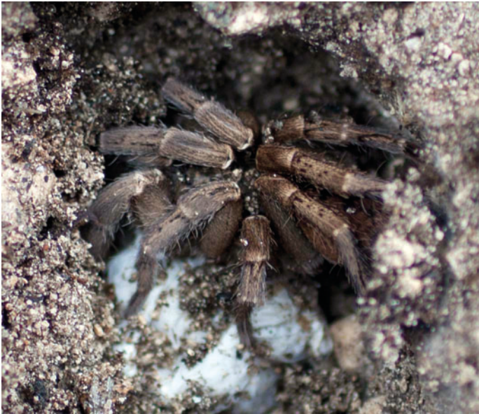
Fig 2. Female Nesiergus insulanus with egg sac in burrow and displaying defensive behaviour type: immobility-body cover.