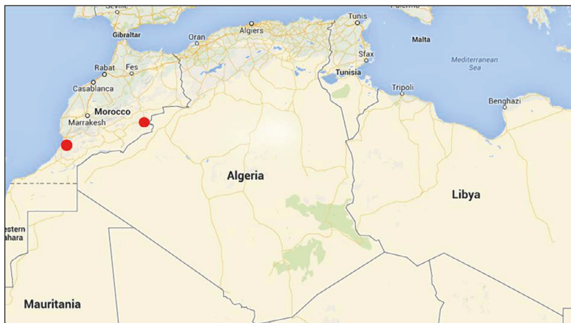
Fig. 17. Distribution of Cithaeron dippenaarae sp. n.