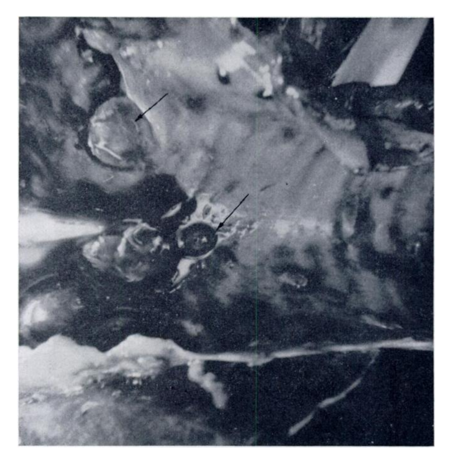
FIGURE 1. Nodules containing Filaroides osleri (arrows) at the tracheal bifurcation of a juvenile coyote.

Although Alaria americana was found in the small intestine of all 13 coyotes, there were no gross lesions observed associated with its presence. In dogs the parasite is not regarded as a significant pathogen, though a catarrhal duodenitis has been observed in certain cases. <sup>12</sup> Allen and Mills' study in Saskatchewan revealed no clinical signs and only mini-