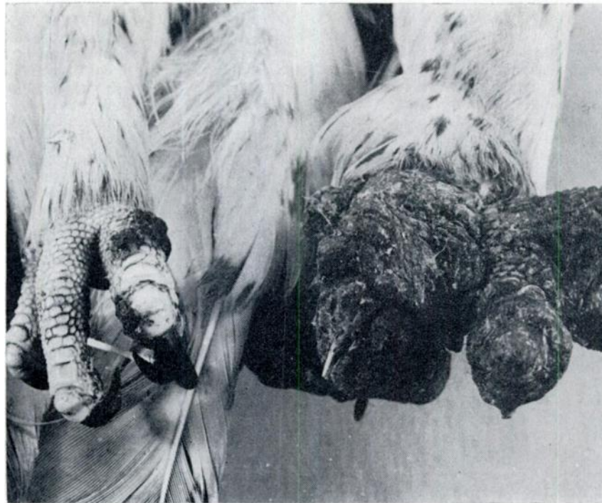
FIGURE 1. Feet of rough-legged hawk with pox infection.

by the 98th day post-inoculation. Histologically, the skin lesion on the first red-tailed hawk was similar to the smaller lesions in the rough-legged hawk.