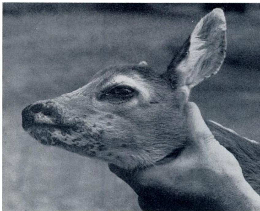
FIGURE 1. White-tailed deer buck fawn with papules of dermatophilosis on the muzzle and ear margin.

In Giemsa-stained 10 \mu m frozen sections from skin lesions, long, parallel chains and individual coccoid cells characteristic of D. congolensis were evident primarily in the stratum corneum, with foci of these organisms frequently associated with hair follicles (Fig. 2). Hyperkeratosis, delamination and erosion of the stratum corneum resulted from local proliferations of these bacteria. The cel-