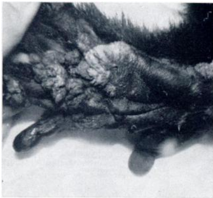
FIGURE 2. Papillomas on feet of Colobus monkey.

Specimens were fixed in 10% formalin and submitted for histologic preparation.