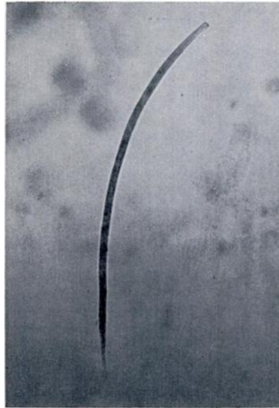
FIGURE 1. Microfilaria of Dipetalonema spirocauda . X1000

In one of the feral seals (E99) vermiform emboli were present in the smaller branches of the pulmonary arteries. The emboli were composed of degenerating adult nematodes. There was necrosis of the arterial wall and an eosinophilic granulomatous arteritis.