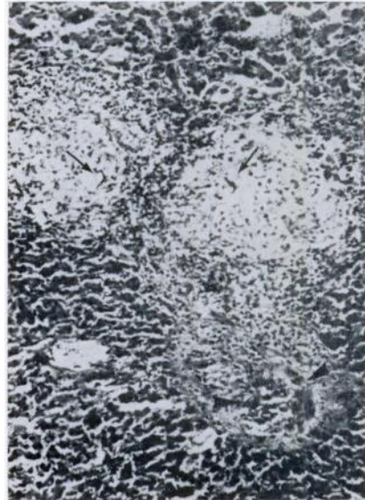
FIGURE 3. Vasculitis and perivasculitis of hepatic vessel (white arrow) with migration tracts to two adjacent necrotic foci. Two microfilariae are present within foci (arrow heads). X 100 H & E.

Lung: Two of the wild seals (C76; C237) also were infected by the pulmonary nematode Otostrongylus circumlitis . The resulting verminous pneumonia masked the pulmonary lesions attributable to the filarial worms alone. However, none of the other three seals had lungworms and pulmonary lesions were present which ranged from acute interstitial pneumonia to eosinophilic granulomatous pneumonia.