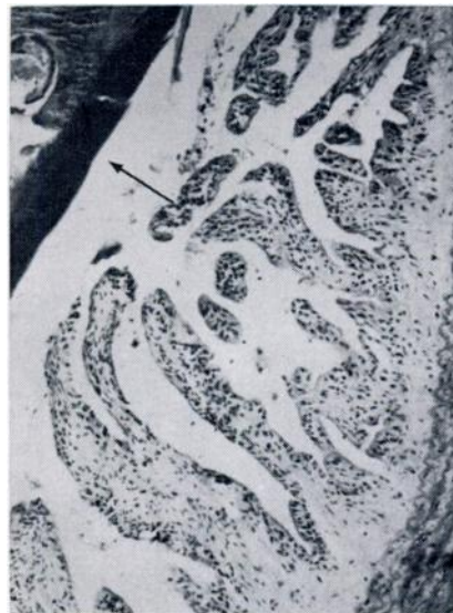
FIGURE 2. Massive villous proliferation of the aortic endothelium. A portion of adult parasite (arrow) is seen in upper right corner. X1000 H & E.