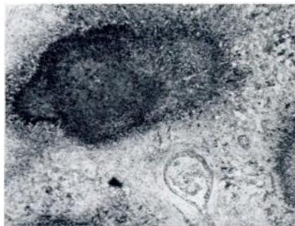
FIGURE 1. Granulomatous reaction surrounding Aspergillus hyphae in the lung of a crow. PAS positive hyphae are also present at the edge of the lesions, PAS X 75.

Lesions were confined to the respiratory system. The nodules in the lungs were granulomatous reactions around fungal hyphae (Fig. 1). In some lungs, a diffuse pneumonia involving airways as well as alveoli also was present. Cel-