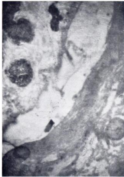
FIGURE 2. Parasitic cyst showing thickened capsule of fibrous tissue around the parasite. H & E. \times 35

Trematode eggs were randomly distributed within the lung parenchyma (Fig. 3). The inner content of some eggs was not visible, only the egg shell being discernible. Alveoli around these eggs were completely consolidated. There was infiltration of mononuclear inflammatory cells and macrophages, resembling a granuloma. Occasionally some eggs released from worms were observed lying in the clear space near the cystic wall. The alveoli in other areas showed atelectasis and blood pigments. Hemorrhage was an occasional feature.