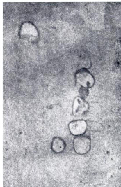
FIGURE 3. Oval clusters within the granuloma and with complete consolidation of lung parenchyma. H & E. \times 70

throughout the lung parenchyma. Wu 7 and McGaughery, 4 while studying the transmission of the parasite also found enlarged and fibrosed submaxillary glands in an infected tigress. Her lungs were consolidated, dark brown, tough and leathery in nature. In the present investigation, however involvement of submaxillary glands was not a feature. Other visceral organs also failed to reveal any pathoanatomical changes. Wu 7 found pleural thickening and atelectasis of lungs and this was clearly observed in the present investigation. However, no communication of the cysts with the bronchioles for escape of eggs could be observed. Jubb and Kennedy 1 reported that in some cases such communications may not be observed and after the death or migration of adults such cavities may be obliterated with fibrous connective tissue.