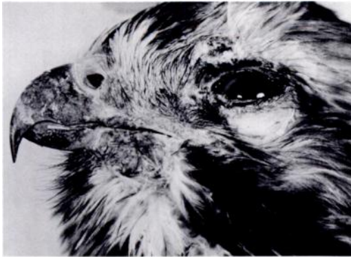
FIGURE 1. Head of adult male red-tailed hawk with pox infection. Note crusted, raised lesion on the brow of the eye and subtle lesions on the skin by the maxillary and mandibular areas.