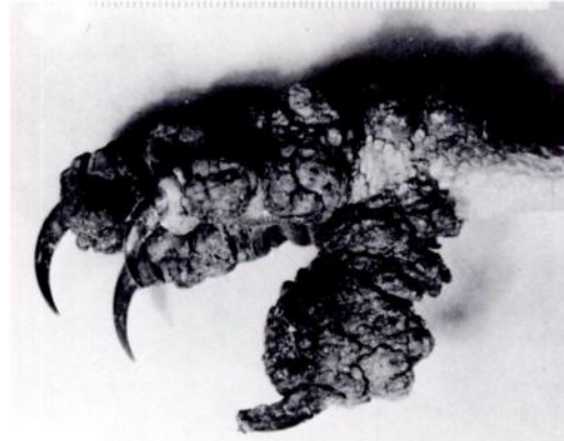
FIGURE 2. Proliferative, fissured foot lesion in an adult male red-tailed hawk.