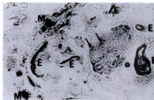
FIGURE 2. Intracellular hemosiderin granules (arrows) within a lesion of the lung. Visible are fragments of egg capsules (E) and pigment-bearing melanomacrophages (M). Perles' Prussian Blue stain for hemosiderin against an unstained background. \times 200 .

Three to 53 adults (mean no. per infected host was 21.5) of L. learedi were recovered from all three heart chambers of six of 11 turtles examined. The turtle infected with 53 worms had a single concentration of these in one chamber. One to 23 Neospiroorchis schistosomatoides adults were present also in hearts of two turtles; the latter infection consisted of a clump of worms in the heart. Adults of both species were recovered in only one turtle. Eggs of L. learedi , which are thin-walled, spindle-shaped (167–213 \mu m wide) and golden-yellow, were found in all squashes and sections prepared. In contrast, eggs of N. schistosomatoides , which are thick-walled, ovoid (37–59 \mu m long by 26–41 \mu m wide), golden-brown and lack-