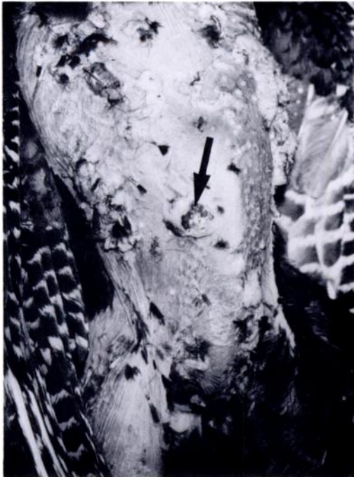
FIGURE 1. Multiple feather follicle cysts on breast of wild turkey.