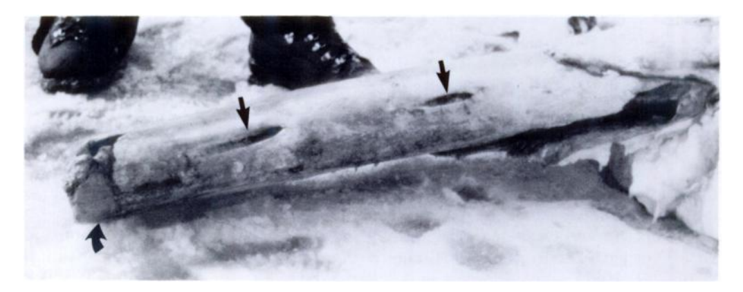
FIGURE 2. Proximal fragment of the fractured right mandible of a female bowhead whale, showing two foramina on the medial aspect (straight arrows). Curved arrow indicates fracture site.

The fractured bone ends had failed to unite and there was no callus (Figs. 1, 3). The disrupted blood supply was thought to be a major cause of this condition. The nature of bone remodelling in cetaceans