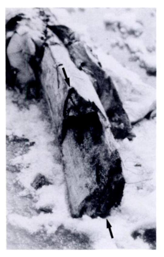
FIGURE 3. Distal fragment of the fractured right mandible of a female bowhead whale. Arrows indicate fracture site. Note the absence of a callus.

mandibular fractures. None has been documented in the literature, and this fracture is the first of any type that we have seen in over 100 harvested bowhead whales.