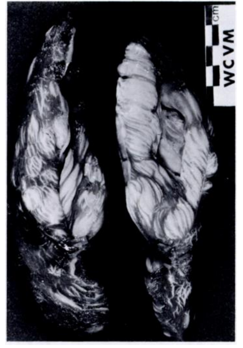
FIGURE 2. Portions of pectoral muscle from a white-fronted goose, showing a diffuse infiltration of the muscle mass by adipose tissue.