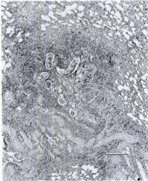
FIGURE 1. Low magnification of Capillaria didelphis induced pulmonary lesion containing sections of parasites, eggs, and a mixture of inflammatory cells and cellular debris. Bar = 200 \mu m.