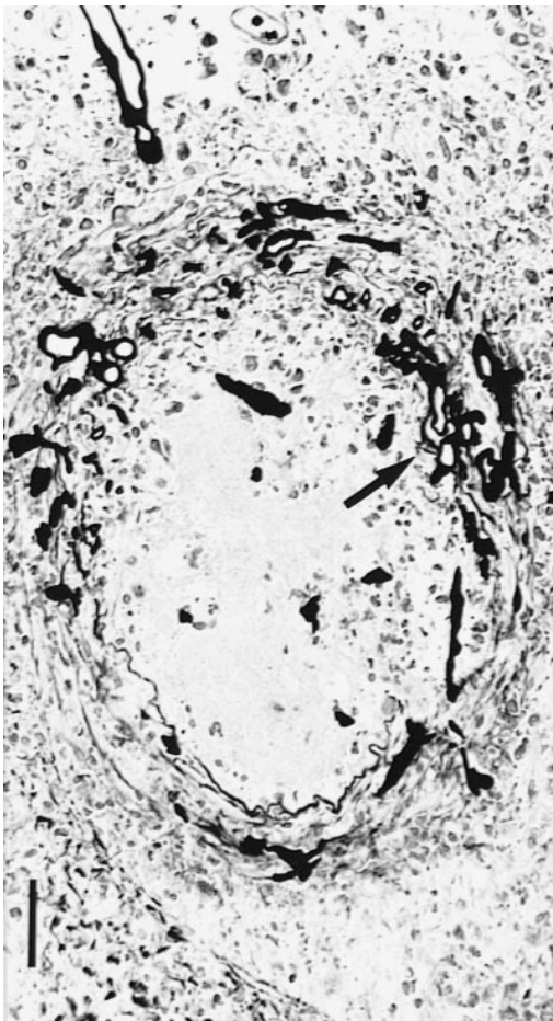
FIGURE 2. Necrotizing thrombarteritis due to fungal invasion (arrow) of the artery wall in the kidney of a harbor porpoise from the Baltic Sea. Grocott stain. Bar = 50 \mu m.