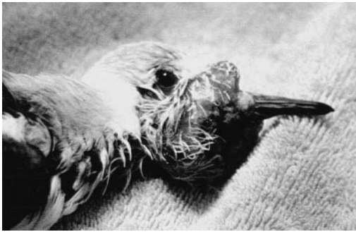
FIGURE 1. Proliferative mass of avian pox at the base of the beak in a sanderling in Florida (USA).

Based on the grave prognosis, the patient was euthanized immediately. Necropsy again revealed no other lesions grossly.