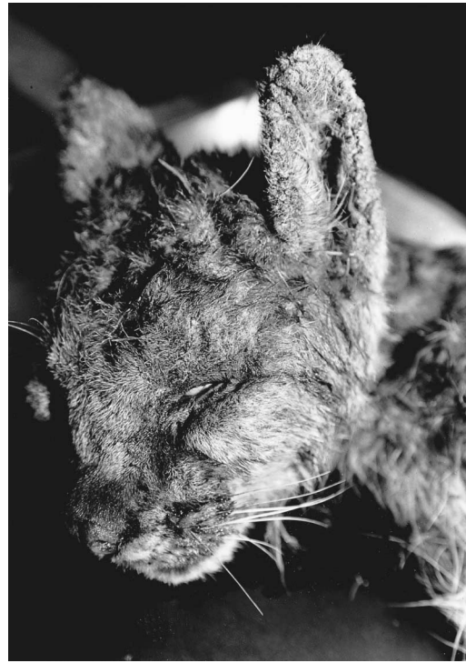
FIGURE 2. Head of Eurasian lynx affected by mange. In this case, there was a mixed infection with Notoedres cati and Sarcoptes scabiei . Notice the thick crusts covering the pinnae and the face and mild alopecia.

All carcasses were immediately brought to the Centre for Fish and Wildlife Health (Berne, Switzerland) for complete standard necropsy. Mange mites were stimulated by light and increased temperature and migrated out of skin samples onto the lid of Petri dishes (Bornstein, 1995). The mites were examined by light microscopy and identified on the basis of typical morphologic characteristics (Neveu-Lemaire, 1938; Sloss and Kemp, 1978; Kettle, 1984). Notoedres cati was isolated from the skin of lynx 1 and 2 and S. scabiei was isolated from lynx 3 and 4. Both mite species were present on lynx 5. Representa-