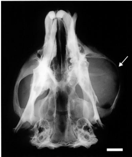
FIGURE 1. Dorso-ventral radiograph of a woodchuck skull showing lateral displacement of right zygomatic arch and thinning of frontal process of zygomatic bone and zygomatic process of temporal bone (arrow). Bar = 1 cm.

erage 136 \mu\text{m} ). Based on these measurements as well as their morphology the cysticerci were identified as metacestodes of Taenia crassiceps , a tapeworm of foxes and other wild canids (Freeman, 1962). The size range reported for large hooks of T. crassiceps in various host species ranges from 129–210 \mu\text{m} , while small hooks range from 95–157 \mu\text{m} (Rausch, 1952; Freeman, 1962; Verster, 1969; Miyagi et al., 1990; Loos-Frank, 2000).