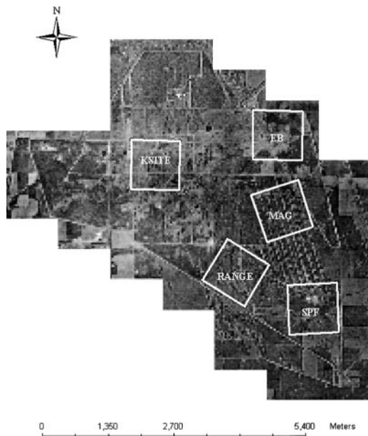
FIGURE 1. Location of five 1-km 2 bait grids on the US National Aeronautics and Space Administration (NASA) Plum Brook Station (PBS) for evaluation of the exposure time relative to raccoon population density of oral rabies vaccination baits placed at 75 baits/km 2 from 20 September through 18 October 2002.

mates of density, despite the fact that animals go undetected during transect surveys (Buckland et al., 1993).