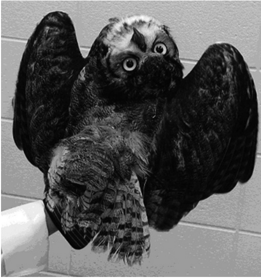
FIGURE 2. Great-horned owl with clinical signs of severe neurological disease associated with avian vacuolar myelinopathy.

Arkansas during the winters of 1994–95 and 1996–97. The outbreaks at CHSTL also are significant because AVM was confirmed in three new species (Canada goose, great-horned owl, and killdeer). Although the recognized range of species susceptible to vacuolar myelinopathy continues to expand, AVM was not confirmed in the small numbers of three species of mammals examined in this study. Although the severity of outbreaks varied from year to year, all confirmed or suspected AVM cases occurred from October through March in each year from 1998–2004.