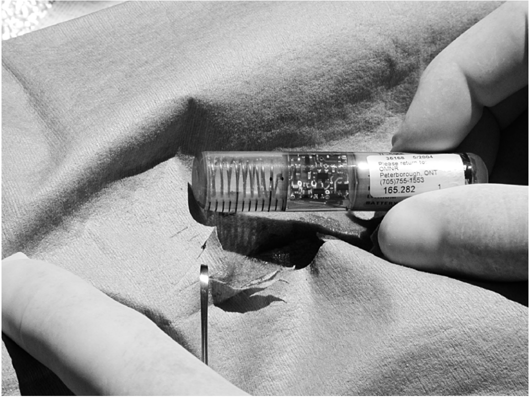
FIGURE 1. A detailed view of an intraperitoneal VHF radio transmitter (7.9-cm length \times 1.7-cm diameter; ATS, Isanti, Minnesota, USA) prior to insertion into the peritoneal cavity of a 5-wk-old wolf pup in Algonquin Provincial Park. The implant consisted of a lithium battery (right), circuit board (middle), and a coiled antenna (left) packaged in a biologically inert resin.

Animal Health, Guelph, Ontario, Canada) (0.1 mg/kg) for sedation and intra-operative analgesia. Anesthesia was then induced with 8% sevoflurane (Sevoflurane, Abbott Laboratories, St. Laurent, Quebec, Canada) in oxygen with a flow rate of 2–3 l/min via a tight-fitting anesthetic face mask. The anesthetic apparatus consisted of a precision sevoflurane vaporizer (Penlon Sigma Delta, Penlon Ltd., Abingdon, Oxon, UK), a D- or E-size aluminum oxygen cylinder, a dial-up combination regulator/flowmeter (Model 3108-L, Inovo Inc., Naples, Florida, USA), a Bain's anesthetic circuit, and a 2-m hose for waste gas. Total weight of the apparatus including the aluminum oxygen cylinder was 11.4 kg with the E-size cylinder, and just 9.7 kg with the smaller D-size cylinder.