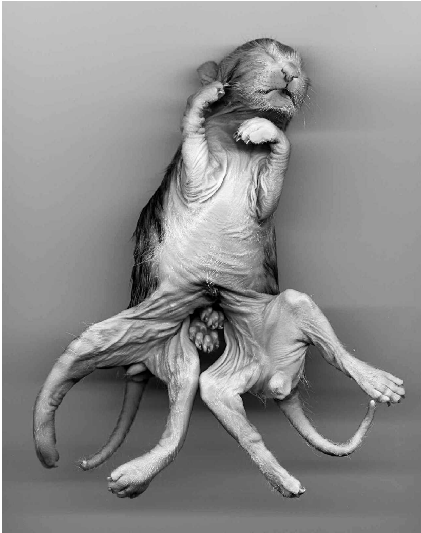
FIGURE 1. Prionailurus bengalensis , cephalopagus conjoined twins (NMR 9990-00002574).

men, genitalia, and all the limbs are usually separate.