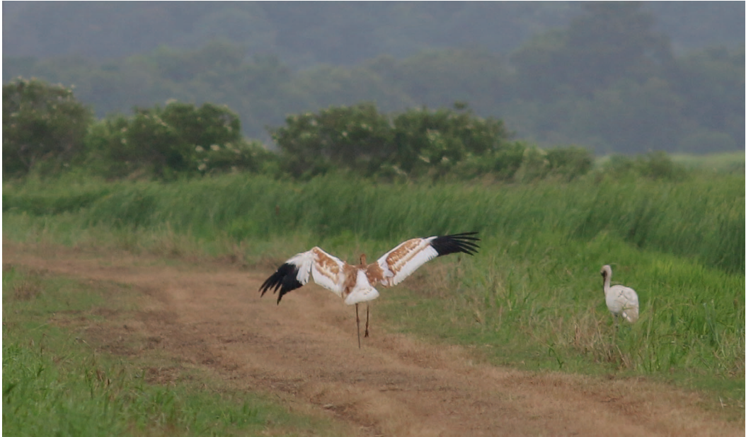
FIGURE 1. Whooping Crane ( Grus americana ) juvenile LW1-16 (center) from the Louisiana, USA nonmigratory population at approximately 14 wk old in 2016. Note the disparity between the fully extended right wing and the partially extended left wing, which is held at an abnormal angle from the carpal joint. Also note the shorter length of the seventh and eighth primary remiges of the left wing, which were delayed in growth but eventually reached full size.

noted contraction of the propatagium and tightness of the tendon which was displaced ventrally, creating a fold on the underside of the leading edge of the wing next to the carpal joint. We attached leg bands and a very high frequency transmitter for identification and tracking purposes, then collected blood and other biologic samples. Once we released the chick, the parents aggressively prevented it from rejoining them, thus finalizing their separation. The chick stayed near (<2.5 km) its parents, who began nesting within days of the chick's capture. However, it is common for immature Whooping Cranes to remain in the vicinity of their natal area (Urbanek and Lewis 2015), so it is conceivable that the wing abnormality did not play a significant role in the distance it maintained from its parents following independence. This same pair of adults raised two healthy chicks in 2018, and GPS data indicated comparable average distances traveled by the families from the nest during the postfledging periods in 2016 (1.0 km) and 2018 (1.4 km), further suggesting