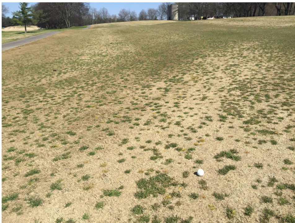
Figure 1. Glyphosate-resistant annual bluegrass ( Poa annua L.) infesting a dormant bermudagrass ( Cynodon spp.) golf course fairway in Rockford, TN.

thoughts on how continued evolution of herbicide-resistant weeds in turfgrass may affect weed management specialists on golf courses, sports fields, and lawns.