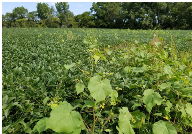
Figure 1. Velvetleaf escape after dicamba applied POST in dicamba/glyphosate-resistant soybean in south central Nebraska.

biennial, and 65 perennial broadleaf weeds (Anonymous 2020). Growers rely on dicamba for POST broadleaf weed control, including control of glyphosate-resistant Palmer amaranth ( Amaranthus palmeri S. Watson) in DGR soybean (De Sanctis et al. 2021); however, velvetleaf escape has been observed where dicamba was the only herbicide applied POST (Figure 1). Murphy and Lindquist (2002) reported poor control of velvetleaf with dicamba at 318 g ae ha -1 under field conditions. Hart (1997) reported 87% velvetleaf biomass reduction with dicamba at 140 g ae ha -1 + halosulfuron-methyl at 9 g ai ha -1 . Herbicide efficacy can be affected by velvetleaf plant height. Knezevic et al. (2009) reported 84% and 68% velvetleaf control with glyphosate at 1,059 g ae ha -1 when plants were 12 cm and 25 cm tall, respectively, at the time of glyphosate application. Ganie and Jhala (2021) reported velvetleaf density of 1 plant m -2 with glyphosate at 1,060 g ae ha -1 applied to 8- to 12-cm-tall plants compared with 7 plants m -2 in the nontreated control.