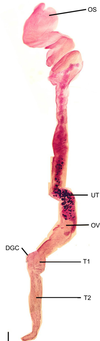
Fig. 1. Composite photograph of Choanoctyle sp. collected from Chelodina longicollis in Tasmania. DGC, dorsal genital complex; OS, oral sucker; OV, ovary; T1, anterior testis; T2, posterior testis; UT, uterus with eggs. Scale bar: 200 \mu m.

The family Thrinascotrematidae contains a single species, Thrinascotrema brisbanica (Tkach 2008b). Comparison of the measurements of the specimens collected in this study with