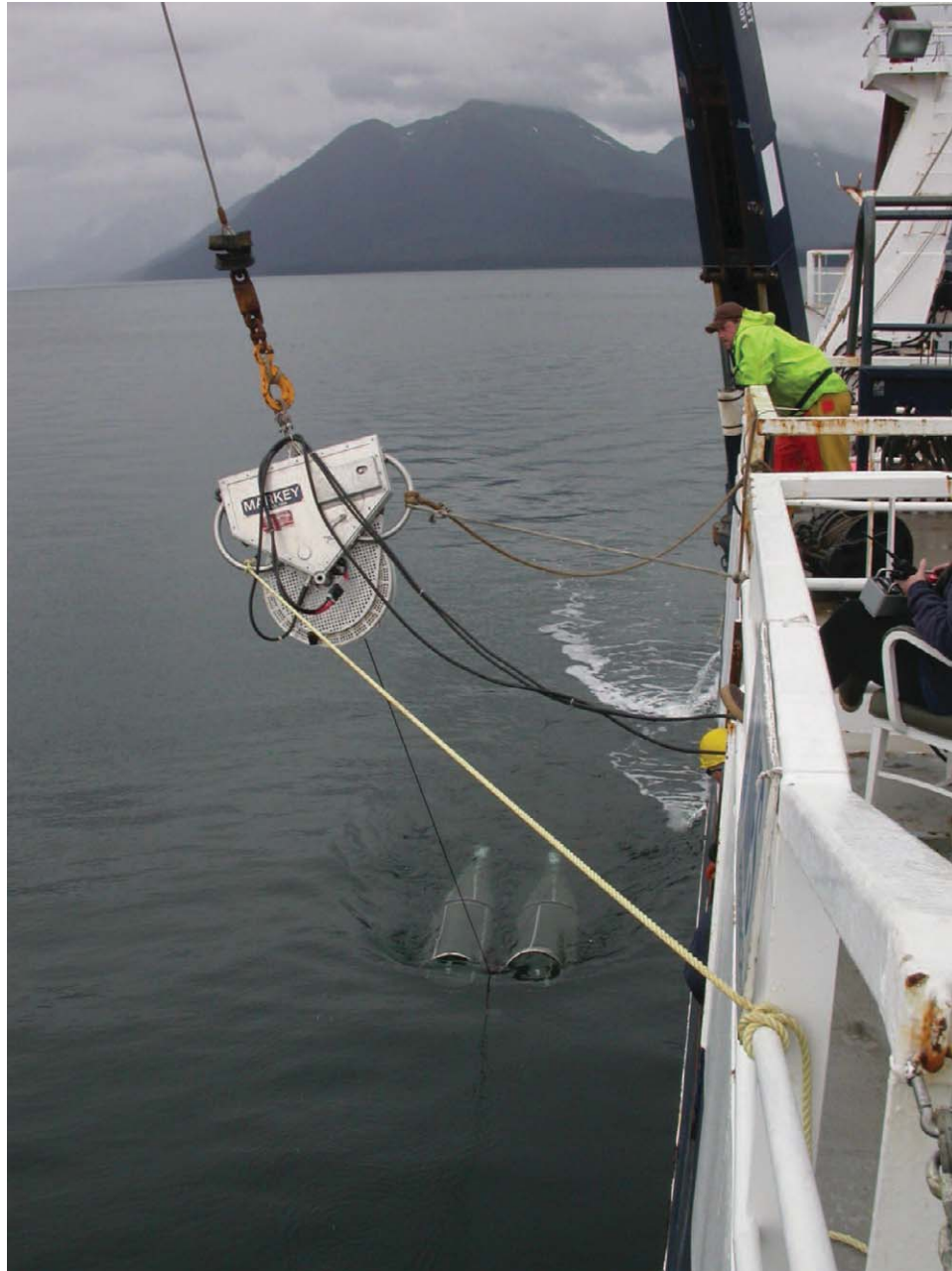
FIGURE 4. Bongo net being retrieved by the Sidewinder block winch suspended from the amidships boom on the 50-m charter FV Northwest Explorer . The remote control operator is partially visible at right, and the net is being retrieved through a “barn door” by the scientist in the yellow hardhat.

and internal level-wind are protected by an aluminum frame that also provides a watertight compartment for the electric motor controller and contains stainless-steel drive components for the level-wind. The electric motor in its watertight enclosure, the stainless-steel reduction gear box (Mulcahy 1981; Dempke and Griffin 1997), and the sealed electromagnetic motor brake (Figure 2) are located above the drum. The drum is driven by a self-lubricated chain and has capacity for 400 m of 4.8-mm-diameter lightweight, high-strength (2,500 kg) plasma soft-line