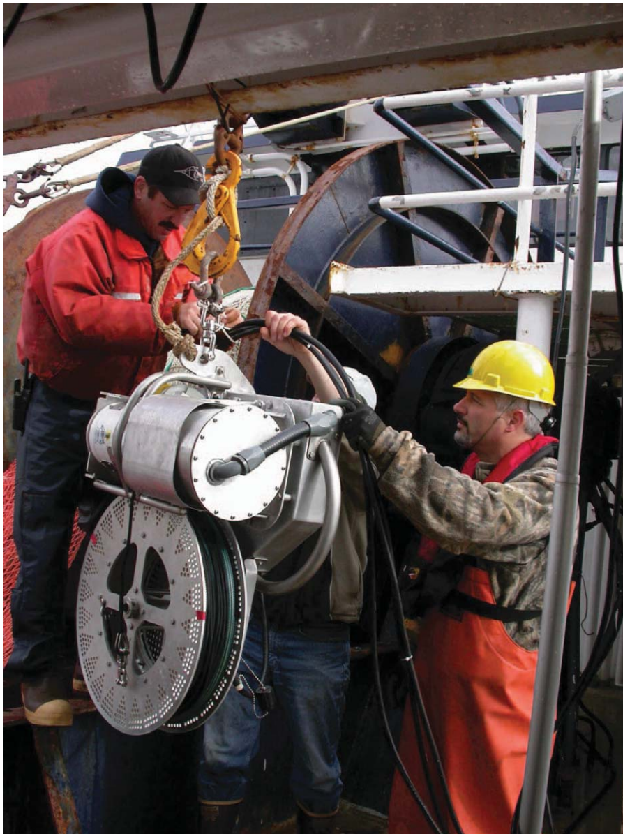
FIGURE 2. Photograph of the Sidewinder block winch showing the aluminum housing of the drum below the (left to right) planetary reducer, brake, line guide, and motor and the lifting handles above.

In contrast to the summer surveys, which include fish trawling, the SECM survey in May is restricted to oceanographic sampling for which the laboratory's 7-m RV Quest is of adequate size. The standard conductivity-temperature-depth (CTD) and vertical plankton net tows are readily accomplished using a hand line through a block, but the BONGO zooplankton net (about 45 kg) requires towing in a double-oblique trajectory to 200-m standard depths at a payout (deployment) speed of 1.0 m/s out and inhaul (retrieval) speed of 0.5 m/s (Orsi et al. 2004).