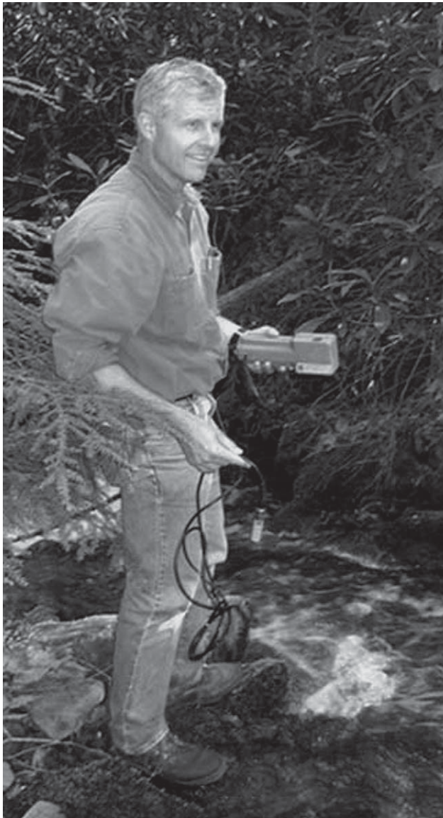
Figure 1. Patrick J. Mulholland (1952–2012), leader of the Lotic Intersite Nitrogen eXperiments (LINX).

physical data set (Zhang et al. 1999, Hubbard et al. 2013) through collaboration across the disciplines of hydrology, ecology, geography, and modeling. Collaboration between ecophysicists and hydrologists addressed the fate of water use by vegetation (Brooks et al. 2009). A large cross-continent experiment on terrestrial nutrient enrichment (NUTNET) has provided broad and general results (Borer et al. 2014). Like LINX, these studies were able to address large-scale scientific questions by applying disciplinary expertise to interdisciplinary problems through focused collaborative effort.