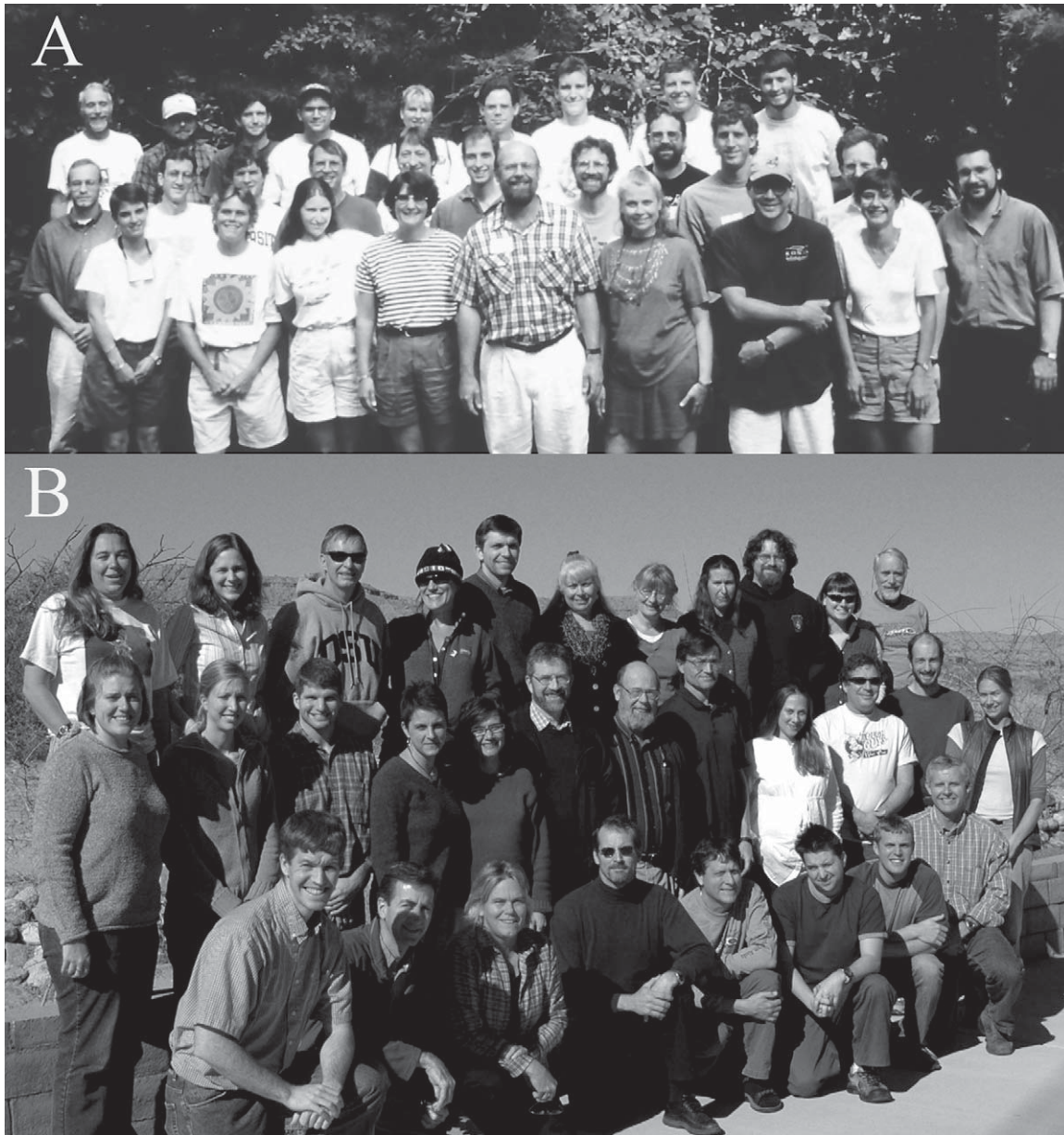
Figure 3. A.—Preliminary group of collaborators at Coweeta Hydrologic Laboratory in 1995 that led to formation of the LINX I group. B.—Lotic Intersite Nitrogen eXperiments (LINX) II collaborators at a synthesis workshop at the Sevilleta long-term ecological research site (LTER) near the end of the experiment in November 2006.

proach, which included whole-stream ^{15}\text{N} -tracer experiments bolstered by other ecosystem measurements, a cross-site comparative design, and integration of modeling and empirical approaches, also added to its appeal.