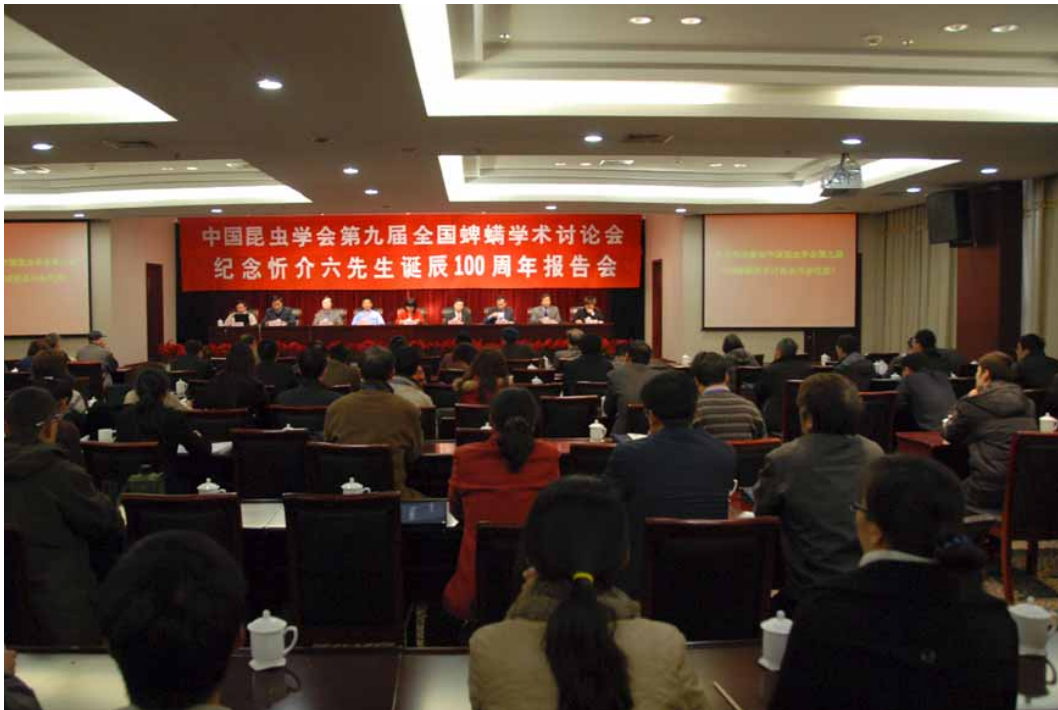
FIGURE 2. The opening session of the Symposium Commemorating the Centenary of Prof Jie-Liu Xin's Birth during the 9th National Congress of Acarology organized by the Entomological Society of China (Nanjing Agricultural University, 28 Nov. 2009).