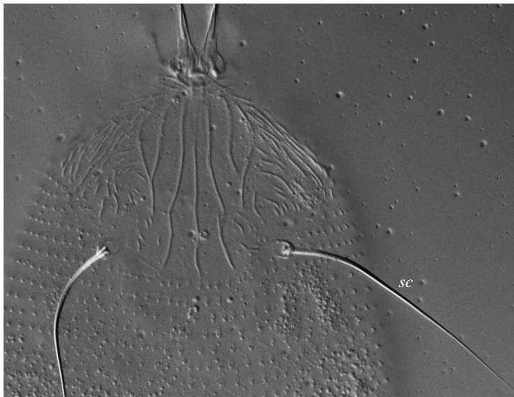
FIGURE 2. Photomicrograph (differential interference contrast microscopy at 1000x oil immersion, Nikon E-90 microscope with the imaging software NIS-Elements BR 3.10) of Aceria thalgi Knihinicki, 2009 collected in Auckland, New Zealand. Female adult in dorsal view showing the prodorsal shield pattern and arrangement of microtubercles on the dorsal annuli. Scale: the distance between the bases of two sc setae is 28 \mu\text{m} . Photograph by Zhi-Qiang Zhang.

Voucher specimens. Collected by N.A. Martin on 20 Jan. 2010 from the rolled leaf edges of S. oleraceus in Mt Albert Research Centre, Auckland; mites mounted in Hoyers medium on 4 slides, with serial number 10-858 Z; deposited in the New Zealand Arthropod Collection, Auckland.