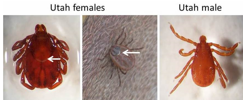
FIGURE 1. Scant gray ornamentation seen on Utah specimens of Dermacentor parumapertus .

Seventy-four adult D. parumapertus ticks (21F, 53M) were removed from 8 black-tailed jackrabbits in central Utah, while 13 adult D. parumapertus (7F, 6M) were found on 4 jackrabbits in western Texas. Three of the Utah rabbits had no ticks on them, while others were heavily parasitized. Ticks were primarily found in the ears and on the head. As for ornamentation, the Utah specimens were barely ornamented. Females displayed only slight gray ornamentation near the posterior edge of the scutum and small spots of whitish-gray distally on the femurs of legs II, III, and IV; males were completely devoid of any ornamentation (Fig. 1). The description of female D. parumapertus ornamentation in Arthur's monograph (Fig. 2) almost exactly matches the pattern we observed in the Utah samples (Arthur 1960). In contrast, Texas specimens were richly ornamented in white. Females were brightly marked with white (not gray) on the scutum very similar to D. variabilis (Fig. 3), and had white spots distally on all femurs. Males from Texas were variously ornamented along the posterolateral margins of the scutum and displayed white spots distally on all femurs.