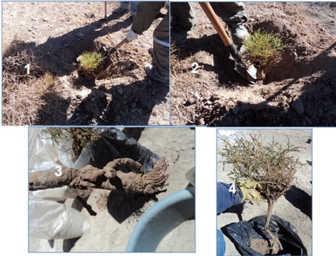
Figure 2. Photographic sequence of the extraction process of the specimens: (1) excavation of the delimiting furrow, (2) pruning of the plant, (3) extraction of a specimen, and (4) transfer of the specimen to a black bag.

VC in 1 kg of tailing (T2). In addition, for treatments T1 and T2 (T0 was not considered because it is the control treatment), the previously mentioned levels of mycorrhiza were considered: 0, 10, 15, and 20 g m -2 .