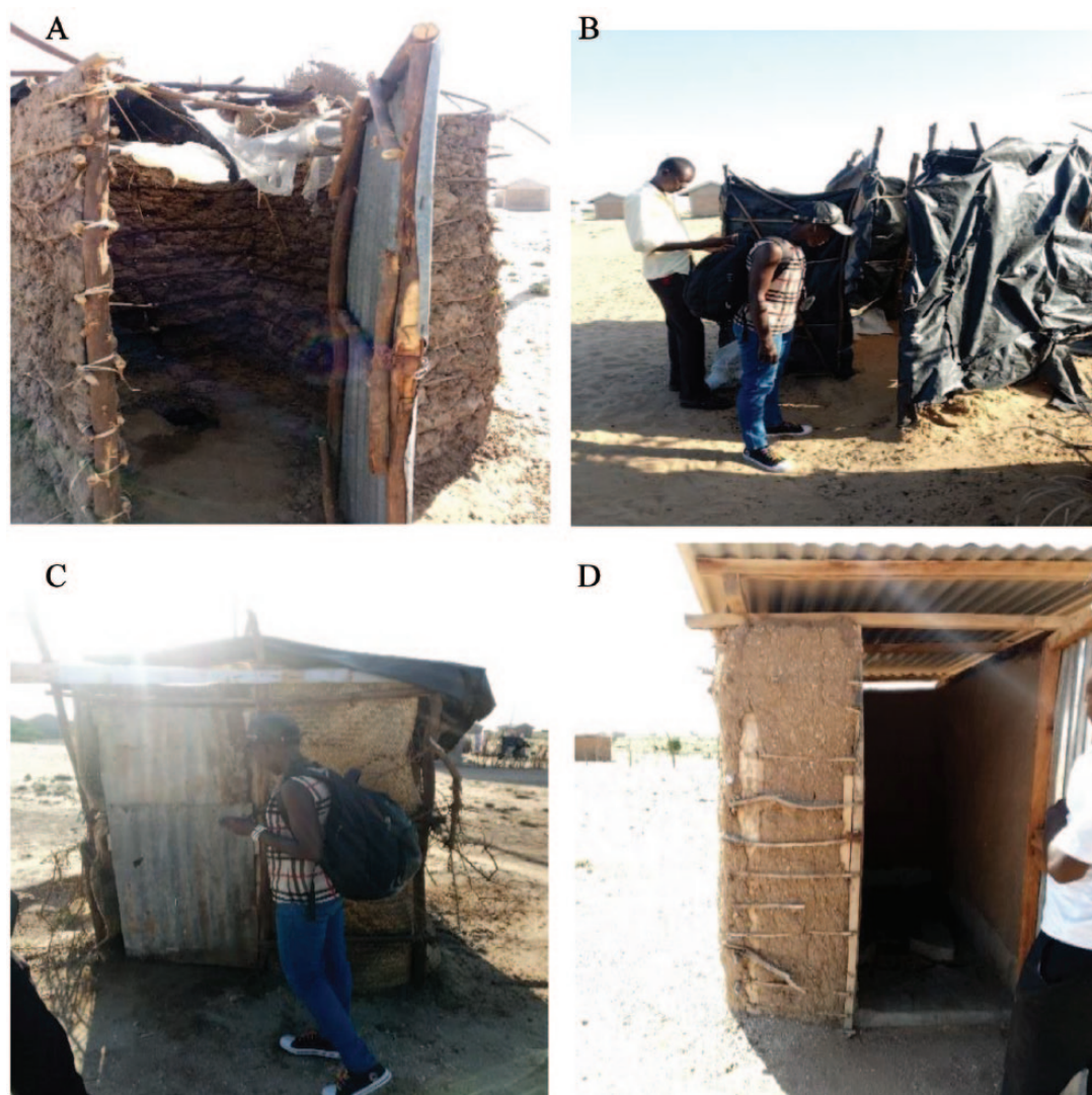
Figure 2. Figure A,B,C and D Showing the nature of latrine facilities in the study area.