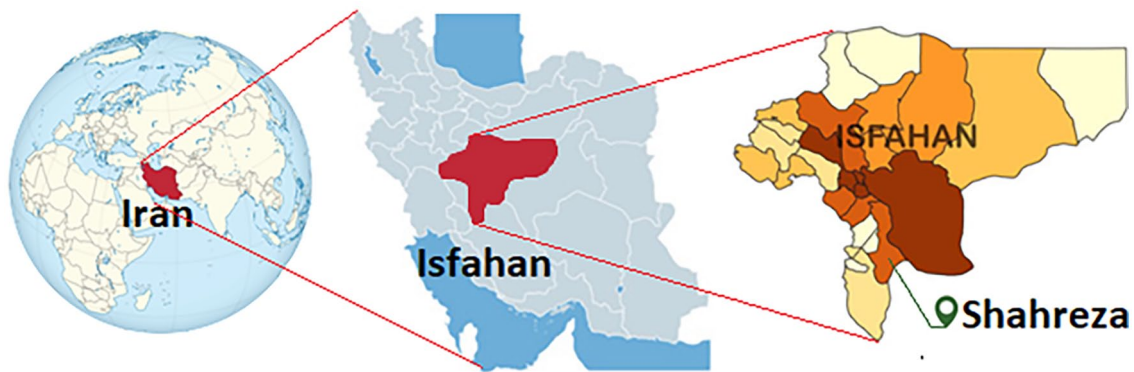
Figure 1. Geographical location of Shahreza in Iran.